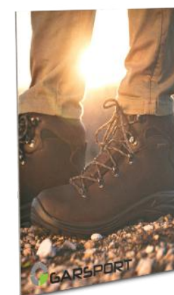
GDPOP00041 GARSPORT CARTELLO VETRINA TREKKING