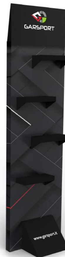
GDPOP00037 GARSPORT TOTEM DISPLAY